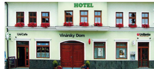
HOTEL VINÁRSKY DOM ***

Holubyho 27, Pezinok, tel.: +421 33 640 09 33, +421 903 476 013, reservation@vinarskydom.sk, www.vinarskydom.sk