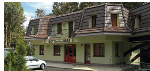
MOTEL NA VRCHU

Pezinok 6668/2, Pezinok, tel.: +421 33 640 3636, +421 903 205 403, recepcia@motelnavrchu.sk, www.motelnavrchu.sk