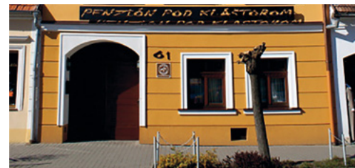
PENZIÓN POD KLÁŠTOROM ***

Holubyho 61, Pezinok, tel.: +421 903 926 166, +421 911 700 390, recepcia@penzionpezinok.sk, www.novy.penzionpezinok.sk