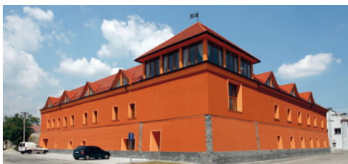
HOTEL MAJOLIKA ***

Súkenická 41, Modra, tel: +421 33 69 08 500, recepcia@hotelmajolika.sk, www.hotelmajolika.sk