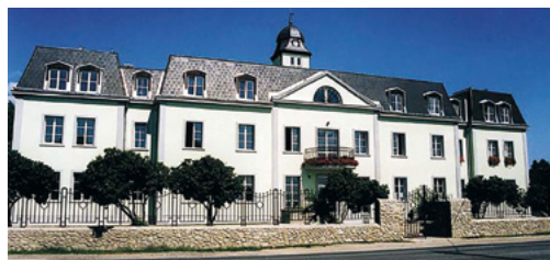
HOTEL AGATKA ***

Pezinská 901/5, Chorvátsky Grob, tel.: +421 911 909 550, +421 2 459 436 11, info@hotelagatka.sk, www.hotelagatka.sk