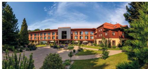
HOTEL ZOCHOVA CHATA****

Piesok 4015/B7, Modra, tel.: +421 33 2633 300, recepcia@hzch.sk, www.hotelzochovachata.sk