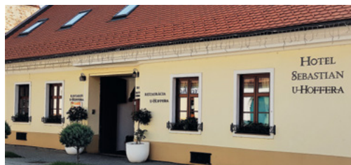
HOTEL SEBASTIÁN U HOFFERA

Dukelská 4, Modra, tel: +421 33 640 7766, info@hotelsebastian.sk, www.hotelsebastian.sk