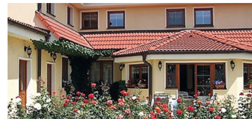
PENZION 77 – GARNI ***

Bernoláková 77, Pezinok, tel.: +421 905 516 583, +421 33 640 01 89, penzion77@stonline.sk, www.penzion77.sk